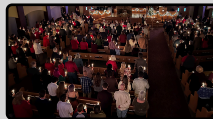
Our congregation gathered on Christmas Eve for our special candlelight service.

This spring, the Youth Ministry will study through Live Sent at 6:15 p.m. each Wednesday starting January 15. We will learn to become more confident, competent, and consistent in sharing the gospel by equipping students to share Jesus effectively in everyday life.